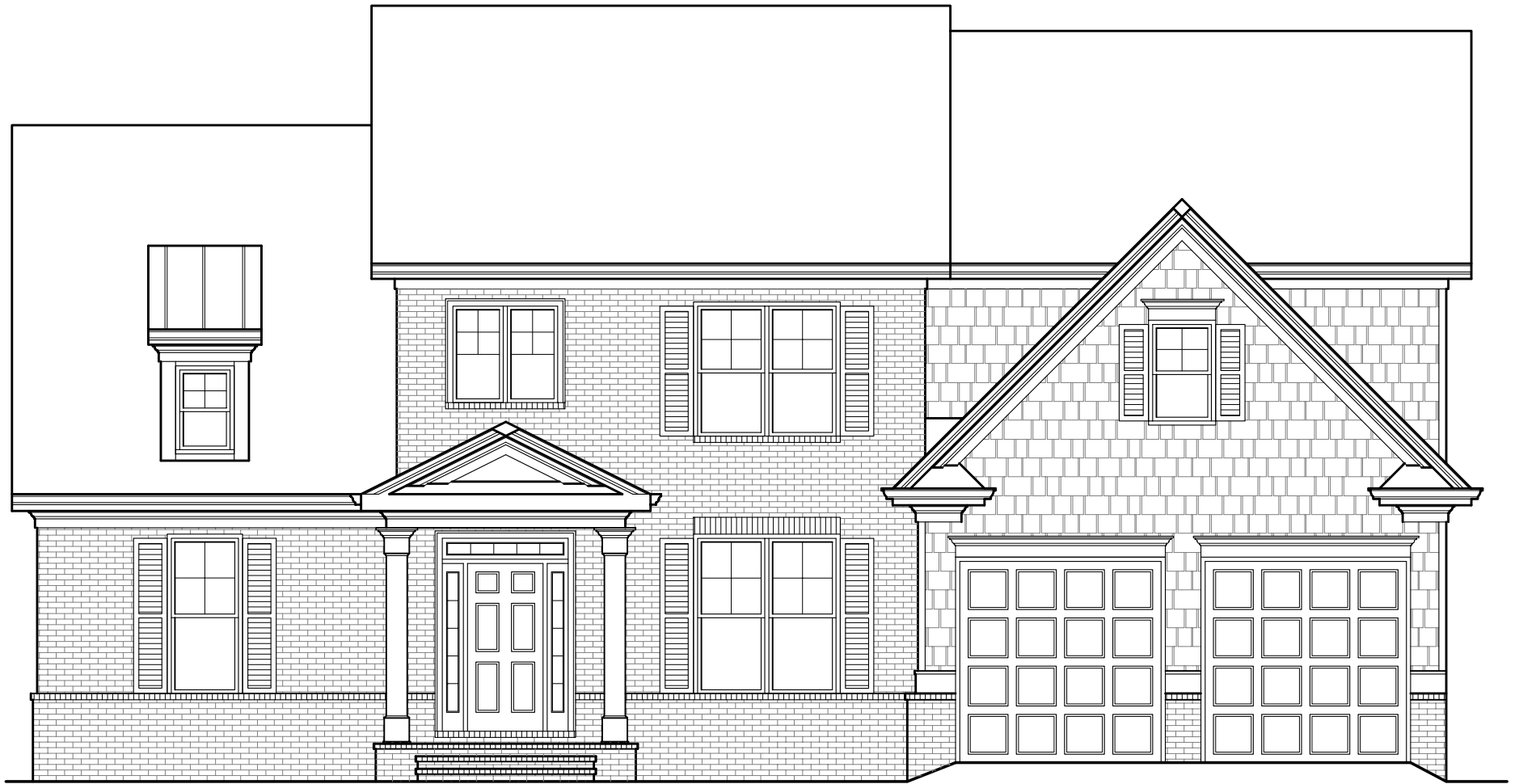
TIBURON "A" FRONT ELEVATION